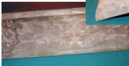
Figure 4: Veneer applied, unfinished

Once that was finished, you'd think I'd stop. But, remember what I said about people going back for more and more procedures?