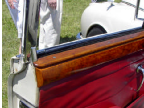
The idea came from older Jaguars at the 2006 Ottawa Concours

Cover is the operative word, because not knowing how things would turn out, and whether I (or a future owner - if that would ever happen) would want to keep it, I wanted to ensure the doors could be changed back to their original state with no underlying damage. The new wood trim had to fit over the leather and would have to be secured by the same (3) screws that normally held the small wood strip in place.