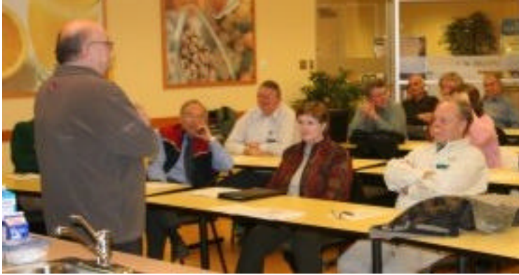
Photo Gallery: The March Meeting