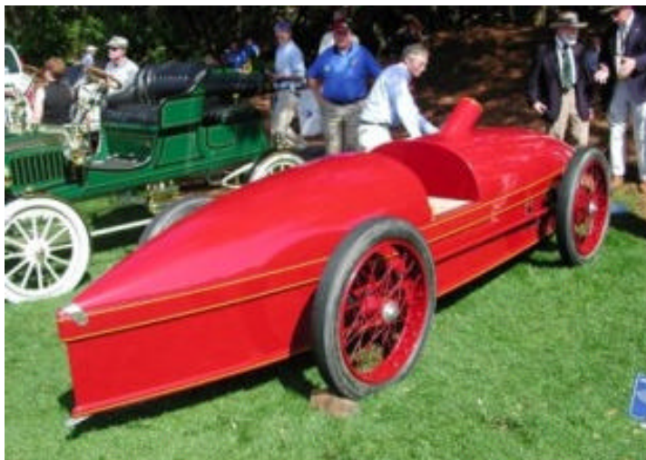
1906 Stanley Rocket