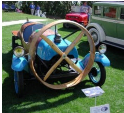
1932 Herlicron No. 1