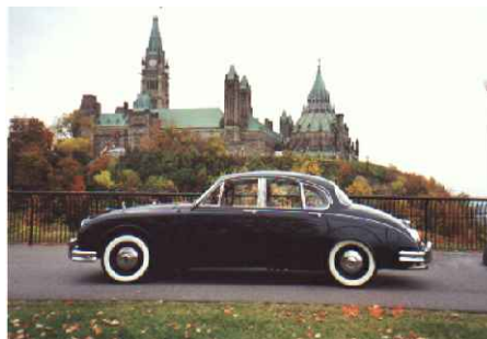
1966 Jaguar Mk 2