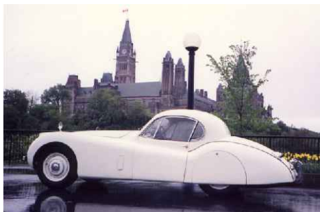
1952 Jaguar XK120FHC