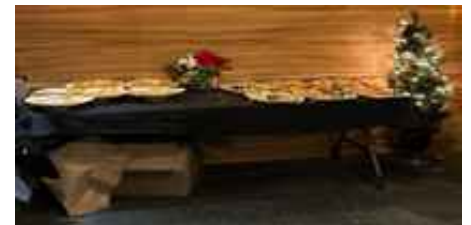
The table of appetizers

As guests arrived, there was plenty of time to mingle and enjoy some holiday cheer and catching up with friends, while enjoying an abundant table of appetizers.